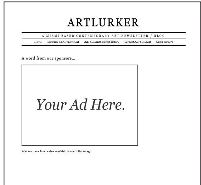
Your ad as it will appear on Artlurker.com

Advertisements will take the form of an image which can be hyperlinked to a website of the clients choice. These advertisements, announced as "a word from our sponsor", will appear exactly like our regular posts. In addition to the image/hyperlink we offer an optional 200 words or less at no additional charge which can appear below the image/page as the feature of the day.